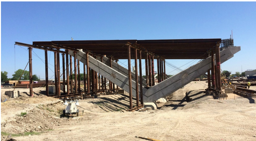
(White Settlement V-Piers for bridges under construction)

As of 2018 fiscal year-end, the District has spent a total of $64.4 million on this project. The City of Fort Worth Tax Increment Reinvestment Zone Number Nine in accordance with the project cost funding agreement as described in Note 1, which accompanies the financial statements, has spent $215.8 million on the project and has an outstanding loan of $186.7 million with the District.