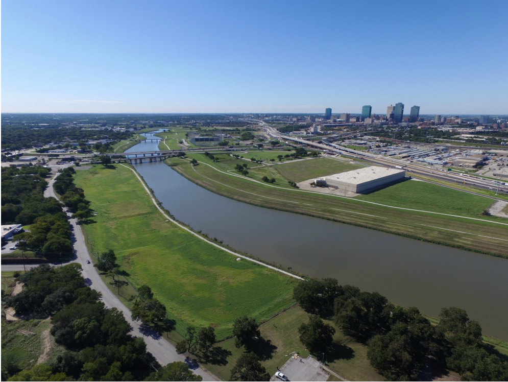
(Construction progress at Riverside Park)