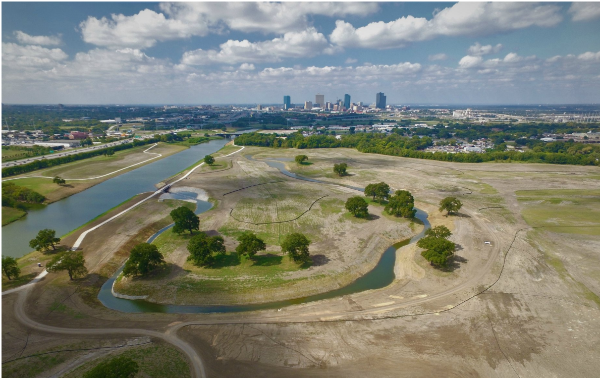
(Construction progress at Gateway Park)

Another exciting component of the Central City portion of the Trinity River Vision is the revitalization of Gateway Park. The plan will include a major renovation to the Park's ecosystem, providing numerous and diverse recreational amenities, and necessary flood storage to ensure the viability of the Central City flood control project.