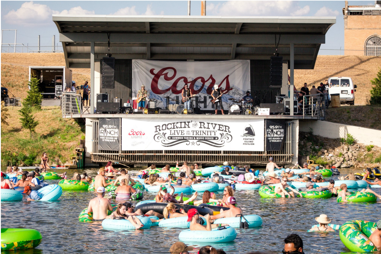
(Rockin' the River July/August 2018)

Additionally, at the confluence of the Clear Fork and West Fork (Panther Island Pavilion), where the urban lake will be created, the TRVA held the Rockin' the River event series, the Sunday Funday series, and Oktoberfest. These events promote the river as a recreational area for the community, and brought approximately 34,000 attendees to Panther Island Pavilion during fiscal year 2018. The Panther Island Ice event, which brings a winter wonderland to the area, brought an additional 19,800 attendees.